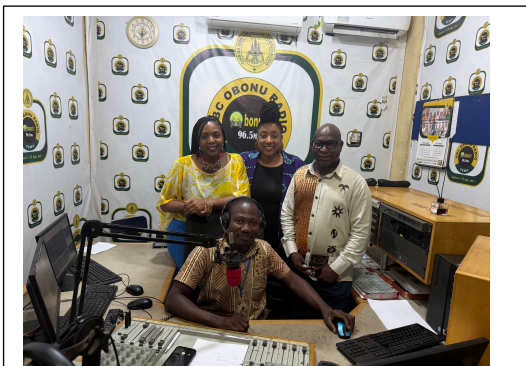
Live radio interview at GBC Obonu 96.5 FM public radio station under the Ghana Broadcasting Corporation.

Visual brain imagery and interactive dialogue allowed participants to connect spiritual understanding with medical science. For many attendees, this was the first time dementia had been explained as a disease process involving measurable brain changes rather than solely spiritual interpretation. One participant reflected, "We attributed it to witchcraft before... but today we are able to take preventive measures. This education helps us understand what is happening." Rather than dismissing faith perspectives, facilitators affirmed the importance of prayer and pastoral care while introducing medical knowledge that reduces stigma and harmful labeling. The result was not replacement of belief systems, but integration, allowing leaders to provide more informed, compassionate guidance.