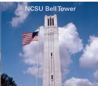
NCSU Bell Tower