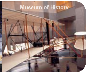
Museum of History